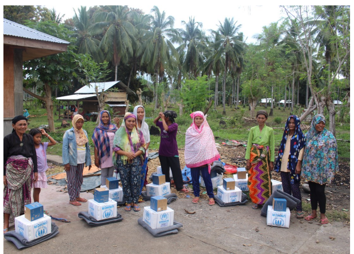
nen IDPs were first to receive core relief items (mats, solar lantern, kitchen set) during distribution displaced IDPs in Mother Tuayan, Datu Hoffer, Maguindanao by UNHCR and partner CFSI.

On the same date, the military detachment stationed in Barangay Pagatin 2, Shariff Saydona Mustapha (SSM) was attacked by the Bangsamoro Islamic Freedom Fighters (BIFF). People residing nearby were forced to flee in a neighbouring village. Affected residents temporarily occupied the covered court in Barangay Sambolawan in Datu Salibu municipality but immediately to their respective residences. returned The Detachment" of the military in the said area is located in close proximity to numerous civilian communities, which is often