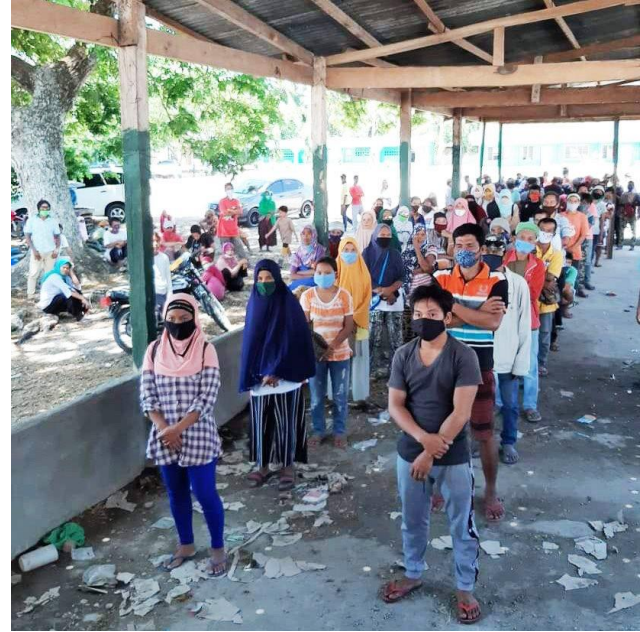
This distribution of Core Relief Items (CRIs) to a total of 944 families is supported by the Australian Government and implemented by UNHCR Philippines and CFSI - Community and Family Services International. Forcibly displaced families from the municipalities of Ampatuan and Guindulungan received hygiene kits, blankets, plastic tarpaulins, solar lamps, and mosquito nets.