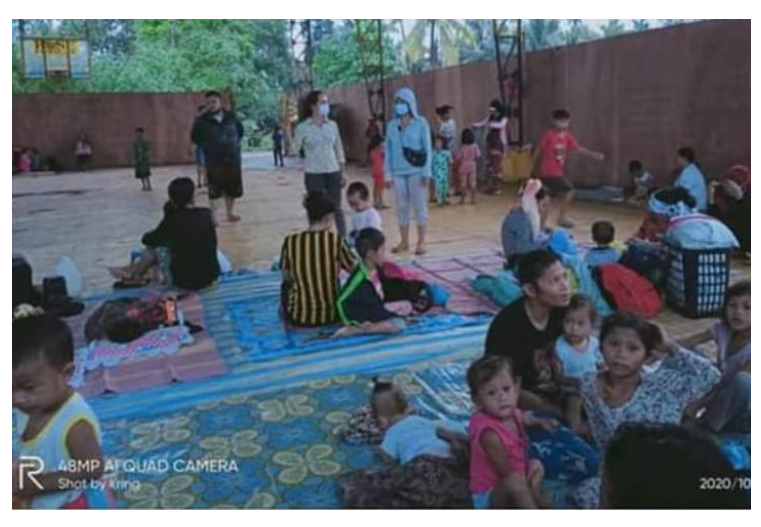
Some of the IDPs stayed inside a covered court in Brgy. Poblacon, Lamitan City.