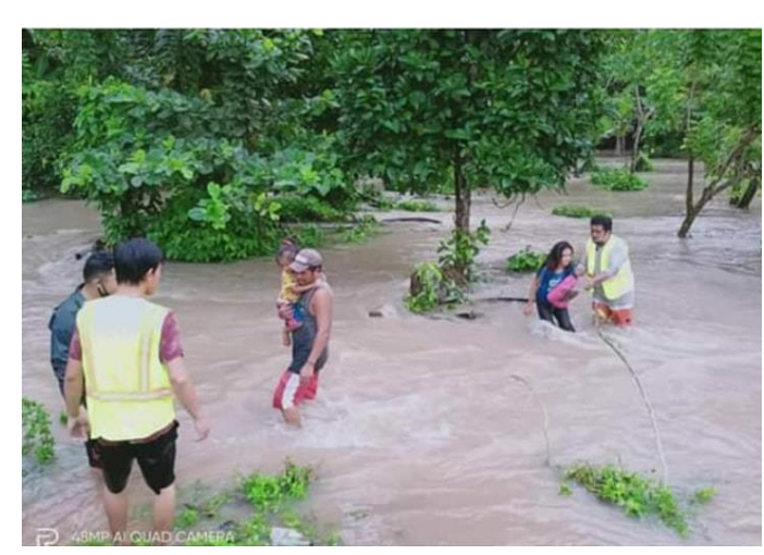
Some of the displaced families assisted by the Rescue volunteer group.