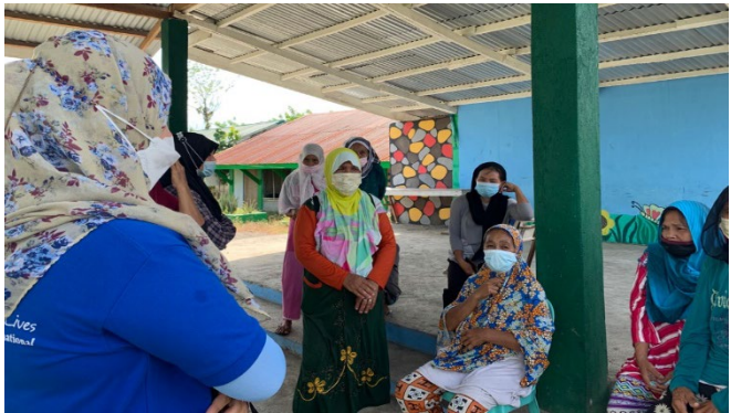
Protection monitoring of IDPs in Datu Mulok Elementary School on 16 February 2022