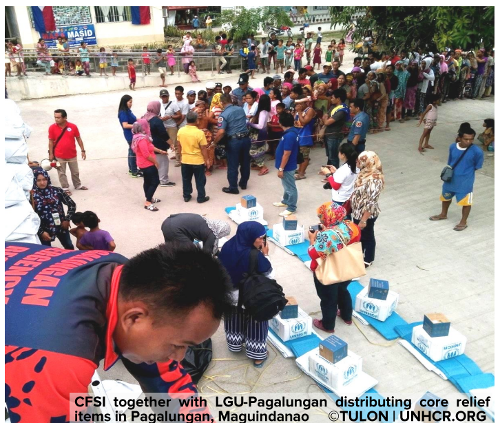
CFSI together with LGU-Pagalungan distributing core relief items in Pagalungan, Maguindanao

On 1 May, an undetermined number of families were displaced as the Armed Forces of the Philippines (AFP) continued its law enforcement operations against the various factions of the Bangsamoro Islamic Freedom Fighters (BIFF) in the area. The military operations included artillery shelling of Brgy. Pikeg and Sitio Maybunga, Brgy. Bagong Upam in the town of Shariff Aguak and helicopter patrols above Brgy. Pandi, Brgy. Inaladen, and Brgy. Pinditen. On 8 May, an undetermined number of residents were displaced when the AFP detachment in Brgy. Timbangan, also of Shariff Aguak town was attacked by BIFF elements and a heavy exchange of gunfire ensued. The AFP subsequently conducted mortar shelling on the retreat positions of the attackers in Brgy. Kuloy, Brgy. Lower Meta and Brgy. Bagong Upam. On 10 May, artillery bombardment of Sitio Balubugan, Barangay Pusaw, Shariff Saydona Mustapha caused an undetermined number of residents from the neighboring barangays of Sambulawan and Pagatin 1 to evacuate to the covered court of the municipal hall.