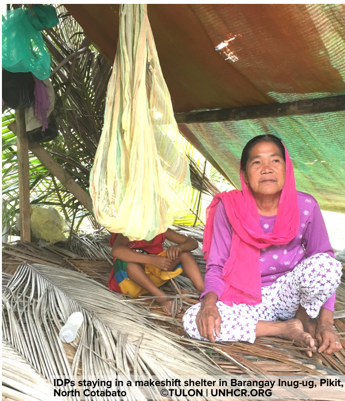
IDPs staying in a makeshift shelter in Barangay Inug-ug, Pikit, North Cotabato

Some 129 families (645 persons) who were displaced since 2017 have returned to their habitual residence in Sulu. Earlier in April 2018, 248 families (2,069 persons) were also able to return. These families were among the 1,139 families displaced by the conflict between the AFP and the Abu Sayyaf Group in September 2017.