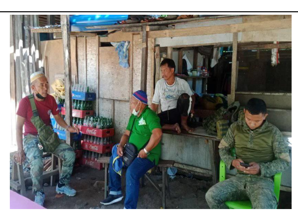
Consultation with the Barangay Chairperson of Bohebaca (in maroon shirt) in relation to the displacement