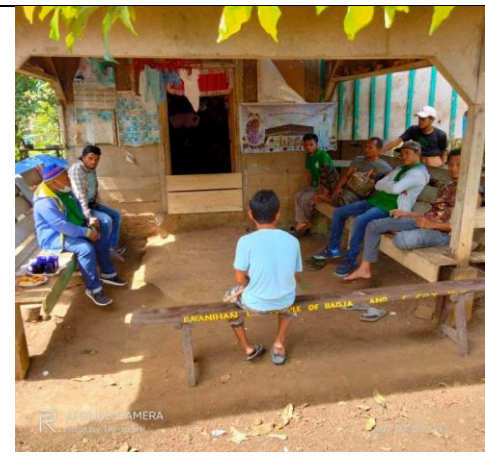
Interview with the IDPs