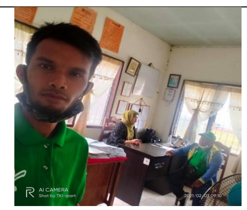
Meeting with MSWO, referral of issues monitored by i-PART