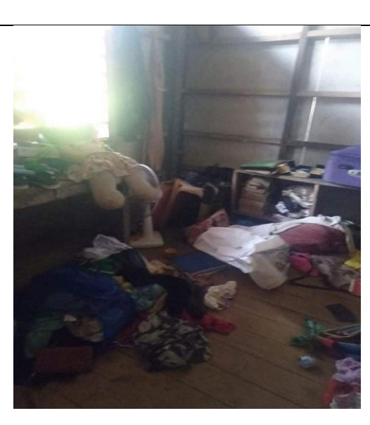
Partially damaged house due to the armed encounter