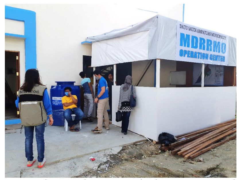
Protection Cluster members participated in the Joint MHT mission the Incident Command Post in Datu Saudi Ampatuan on 31 March 2021