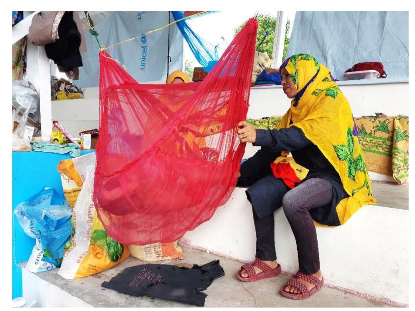
IDPs in Datu Saudi Ampatuan remain hesitant to go back to their places of origin particularly in Barangay Kitango, one of the conflict zones.